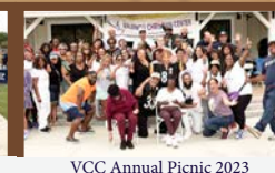
VCC Annual Picnic 2023