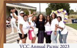
VCC Annual Picnic 2023