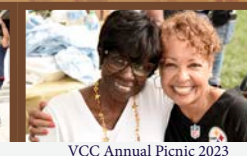
VCC Annual Picnic 2023